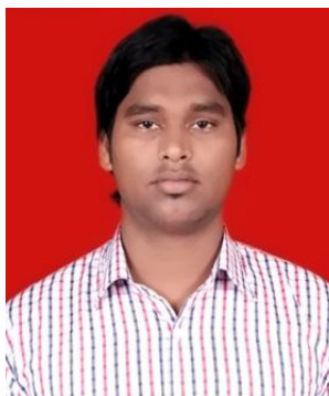
OM PRAKASH RAJA