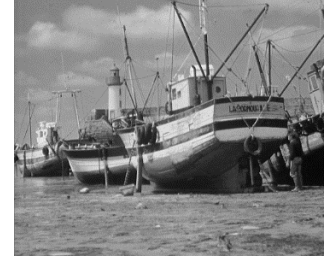
Test images taken for the analysis (3) Boat

missing pixels, and we denote by Si the set of indices of non-missing pixels in the patch xi. We choose the distance measure between patches xi and xj to be the average of squared differences between existing pixels that share the same location in both patches.