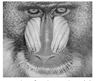
Test images taken for the analysis (2) Baboon,

Test images taken for the analysis (1) Hill