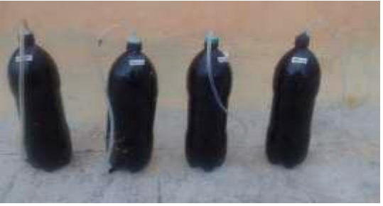
Fig.1 Different bottling setups