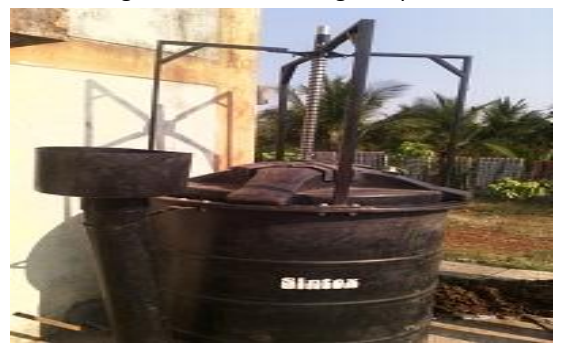
Fig.2 1000 liter Digester setup