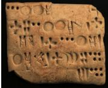
Fig-2 Pictorial description

within each culture beginning the history of handwriting.