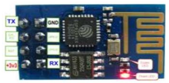
Fig.2 ESP8266 Pin Details

Once it gets connected in a Wi-Fi network, we'll get one IP address which is accessible in its local network. The module is additionally having 2 GPIO pins alongside UART pins. It is also having inbuilt SPI protocol by using the two pins of UART as data lines and by configuring the two GPIO pins as control lines and clock signal. It is also having 1MB on-chip flash memory. Internally it is having power management unit with all regulators and PLLs. The on-chip processor it is having is a 32 bit CPU.