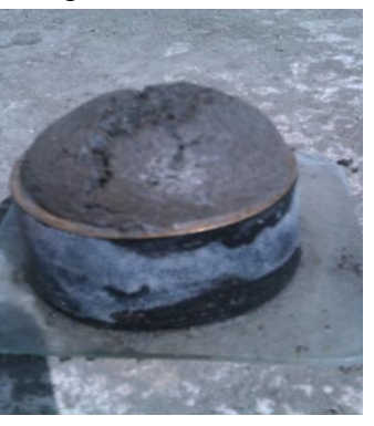
Fig. 2 Vicat apparatus mould