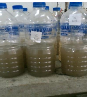
Fig. 1 Alkaline solution

Fineness modulus of fine aggregate Fineness modulus of coarse aggregate Fineness modulus of GGBS Specific gravity of cement Specific gravity of fly ash Specific gravity of fine aggregate Specific gravity of coarse aggregate Initial and Final setting time of concrete