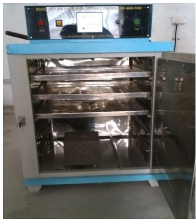
Fig. 4 Heating the cube in oven MIX DESIGN

Mix design is carried out for M20 concrete as per Indian Standard Code method (IS 10262-1982) for concreting the test specimen.