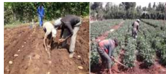
Figure 3. 1. Potato tuber at planting and maturity stage

As shown from the result the difference observed among irrigation methods as combined with irrigation levels in terms of total tuber yield was statically significant (P<0.05) effect (Table 3.5). However, total tuber yield was nearly the same in both (CFI and AFI) irrigation methods at full irrigation application (100% ETC); whereas total depth of water applied under every furrow irrigation was almost double as compared with that of applied under alternate furrow irrigation. The maximum tuber yield was 36.12 t/ha at 100%ETC irrigation application under CFI. The nearest yield of 34.22 t ha -1 was obtained by AFI method at full irrigation application. Alternate furrow irrigation method produced total tuber yield of 33198 kg/ha which showed insignificant difference as compared with that obtained under every furrow irrigation (33369 kg/ha) [23].